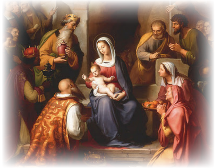
The Epiphany of the Lord