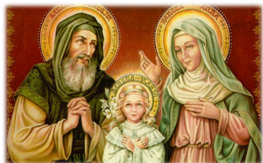
The Nativity of the Blessed Virgin Mary